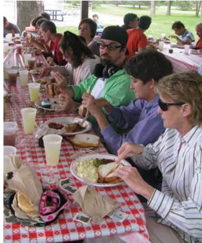
The festive fare gave rise to a cacophony of feasting and flavors!