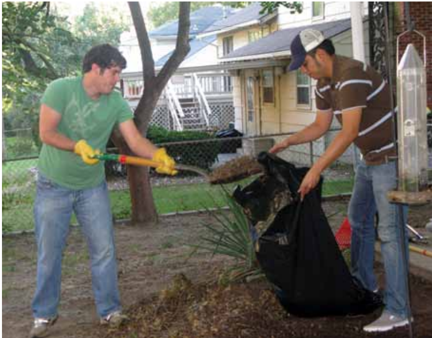
Those yard debris had to go! The group also arranged for the back yard to be aerated and re-seeded by Ryan Lawn and Tree.

Building Resources for People with Disabilities