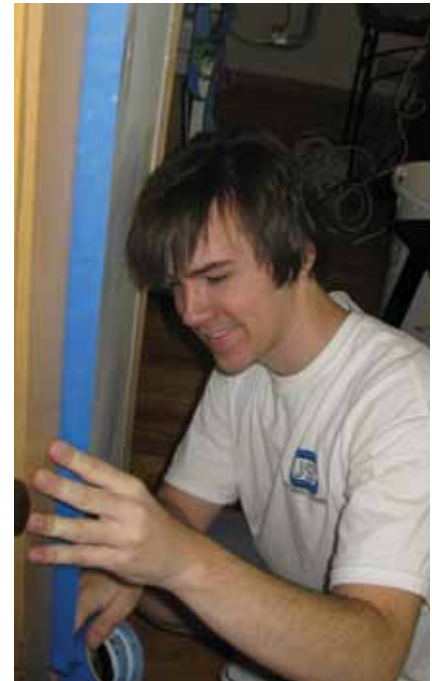
As is so often the case, prep work takes the most time!