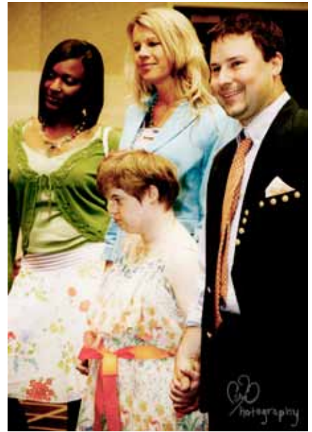
Models from Lisa Demaree's collection.