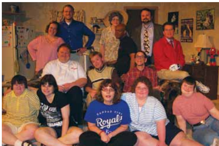
The Boys Next Door's talented cast.

JCDS Night at the Barn Players' was a celebration of locally-acclaimed theater combined with raising awareness about disabilities.